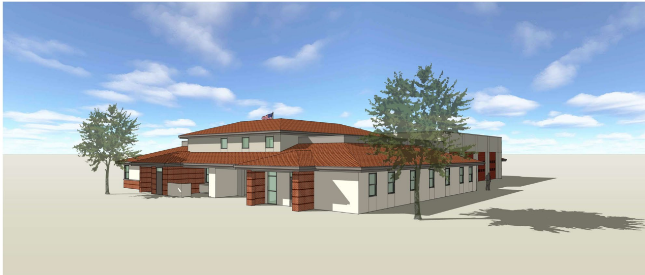
OPTION 3: NORTHEAST VIEW