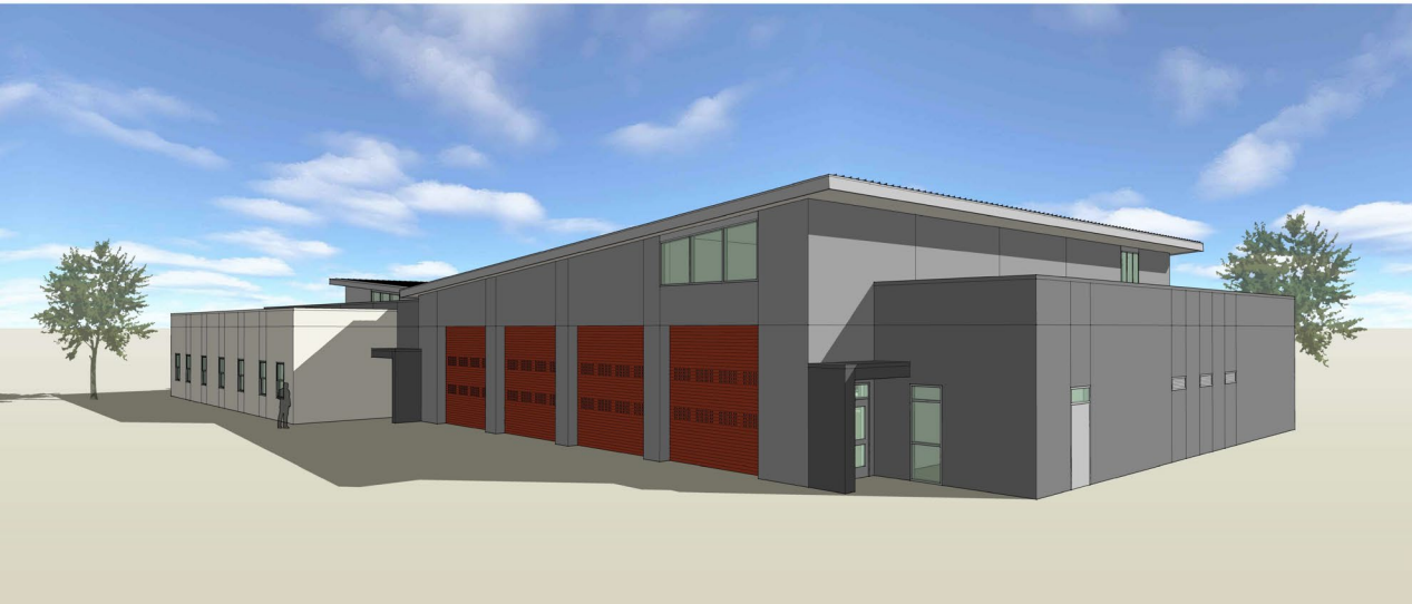
OPTION 2: NORTHWEST VIEW