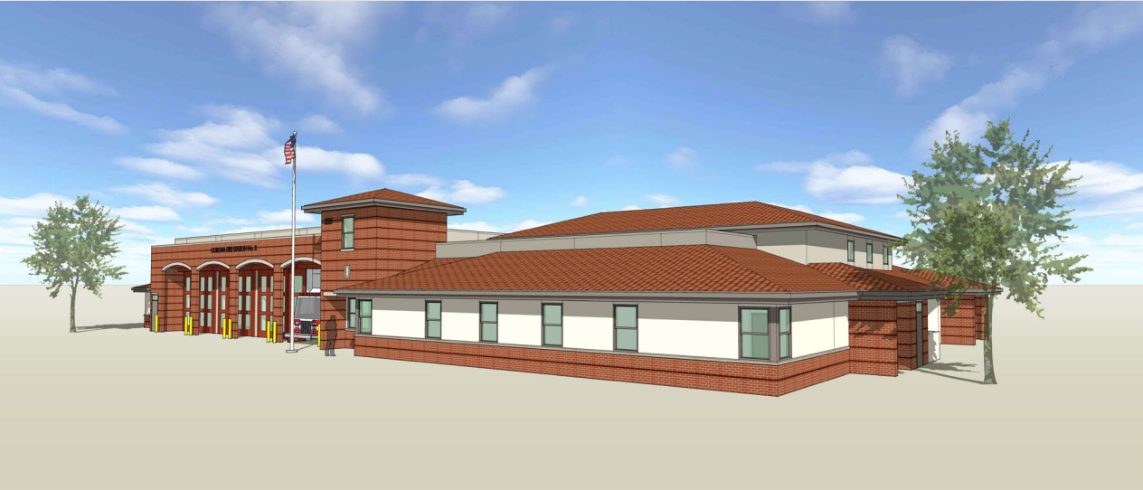
OPTION 3: SOUTHEAST VIEW