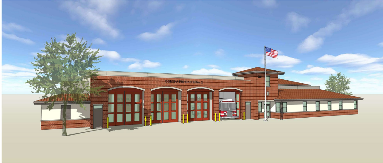
OPTION 3: SOUTHWEST VIEW