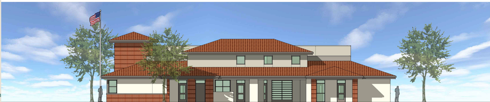
OPTION 3: EAST ELEVATION