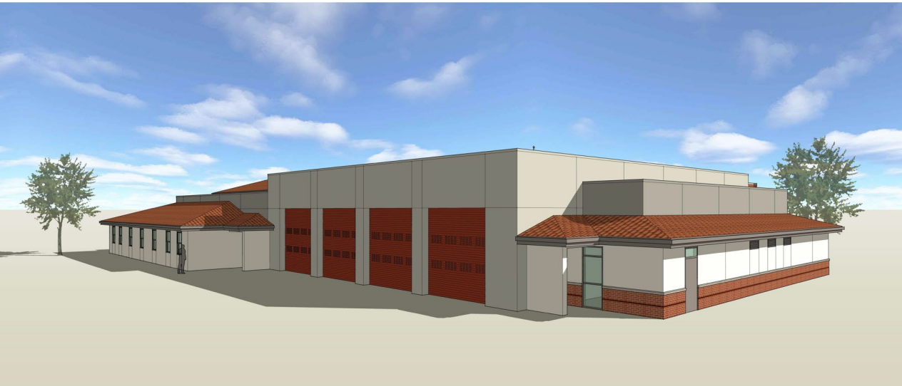
OPTION 3: NORTHWEST VIEW