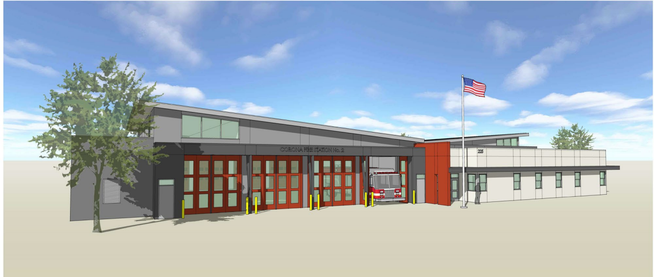
OPTION 2: SOUTHWEST VIEW