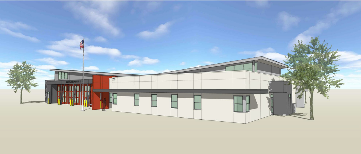
OPTION 2: SOUTHEAST VIEW