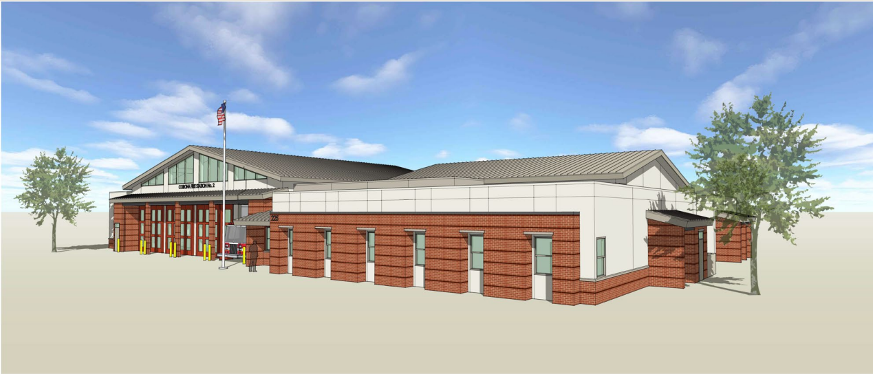
OPTION 1: SOUTHEAST VIEW