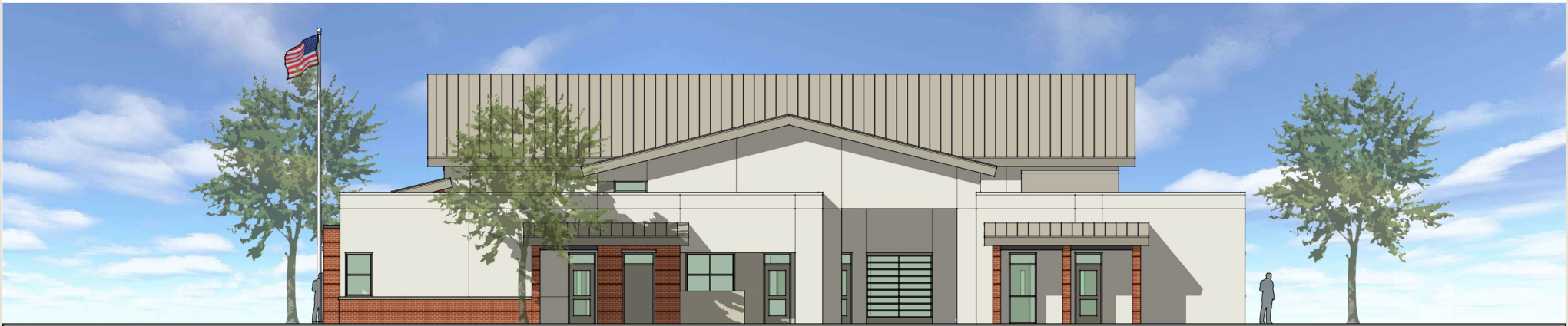
OPTION 1: EAST ELEVATION