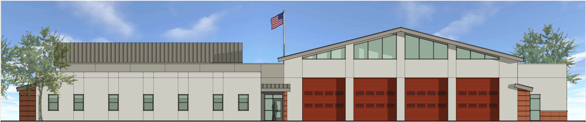
OPTION 1: NORTH ELEVATION