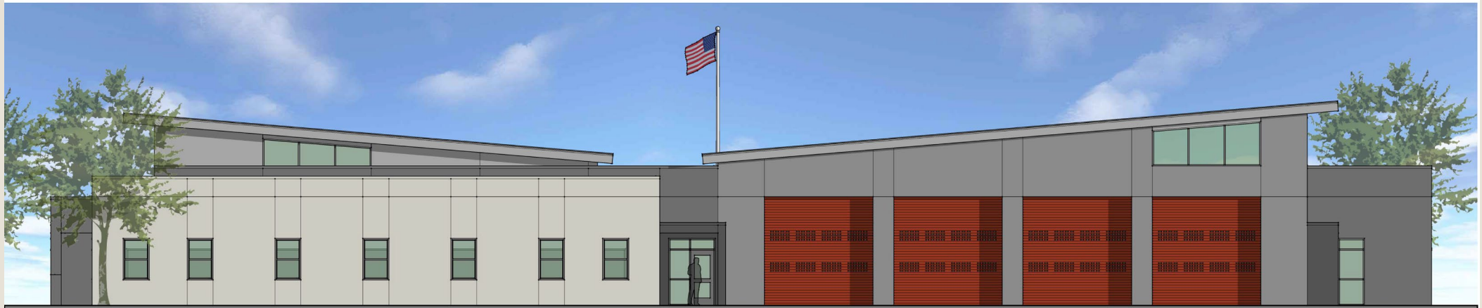
OPTION 2: NORTH ELEVATION