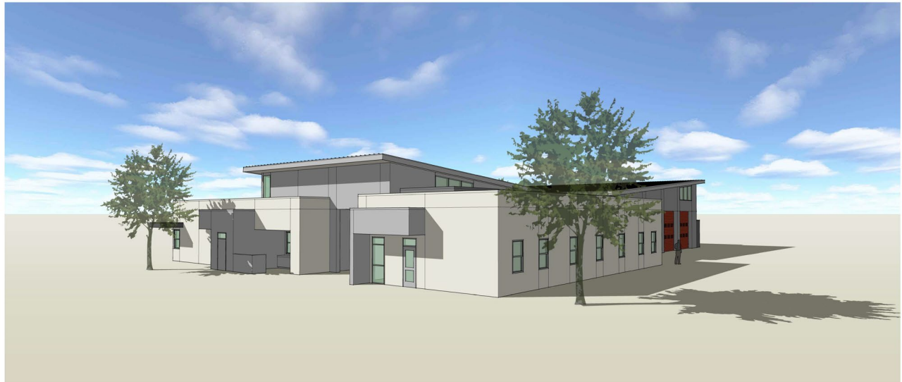
OPTION 2: NORTHEAST VIEW