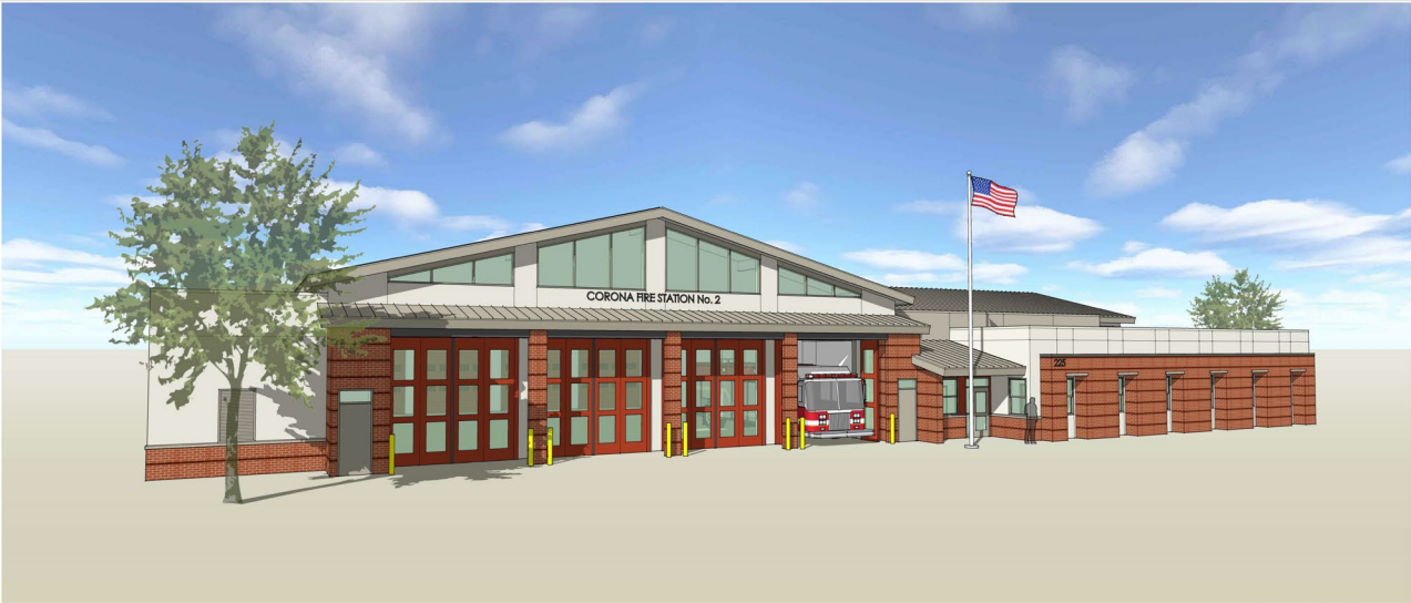
OPTION 1: SOUTHWEST VIEW