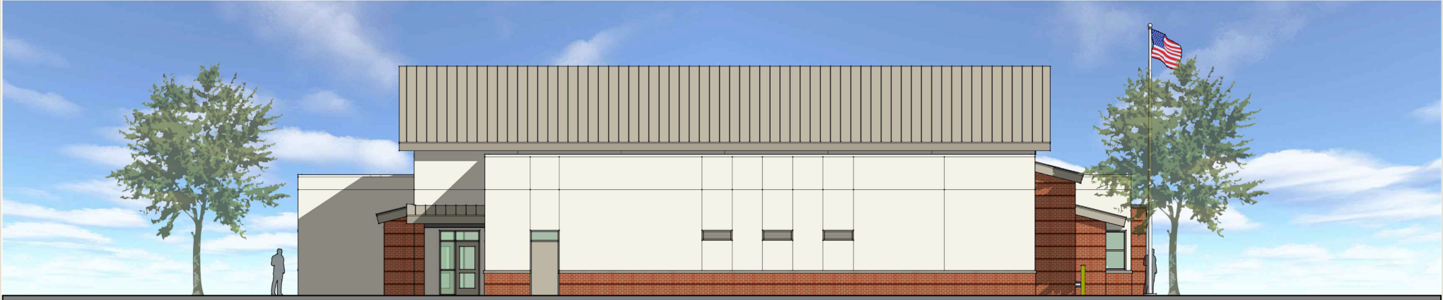
OPTION 1: WEST ELEVATION