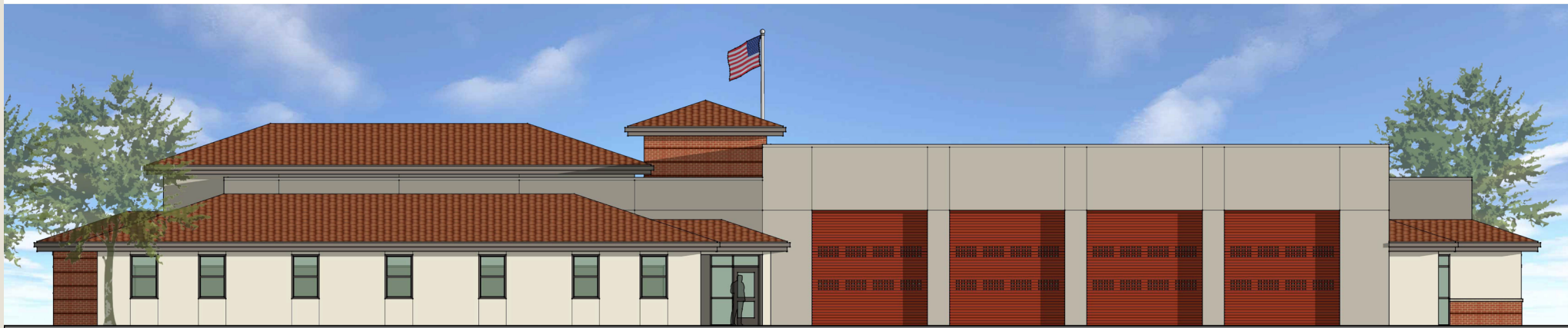
OPTION 3: NORTH ELEVATION