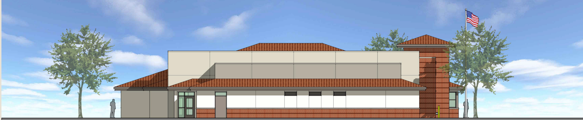
OPTION 3: WEST ELEVATION