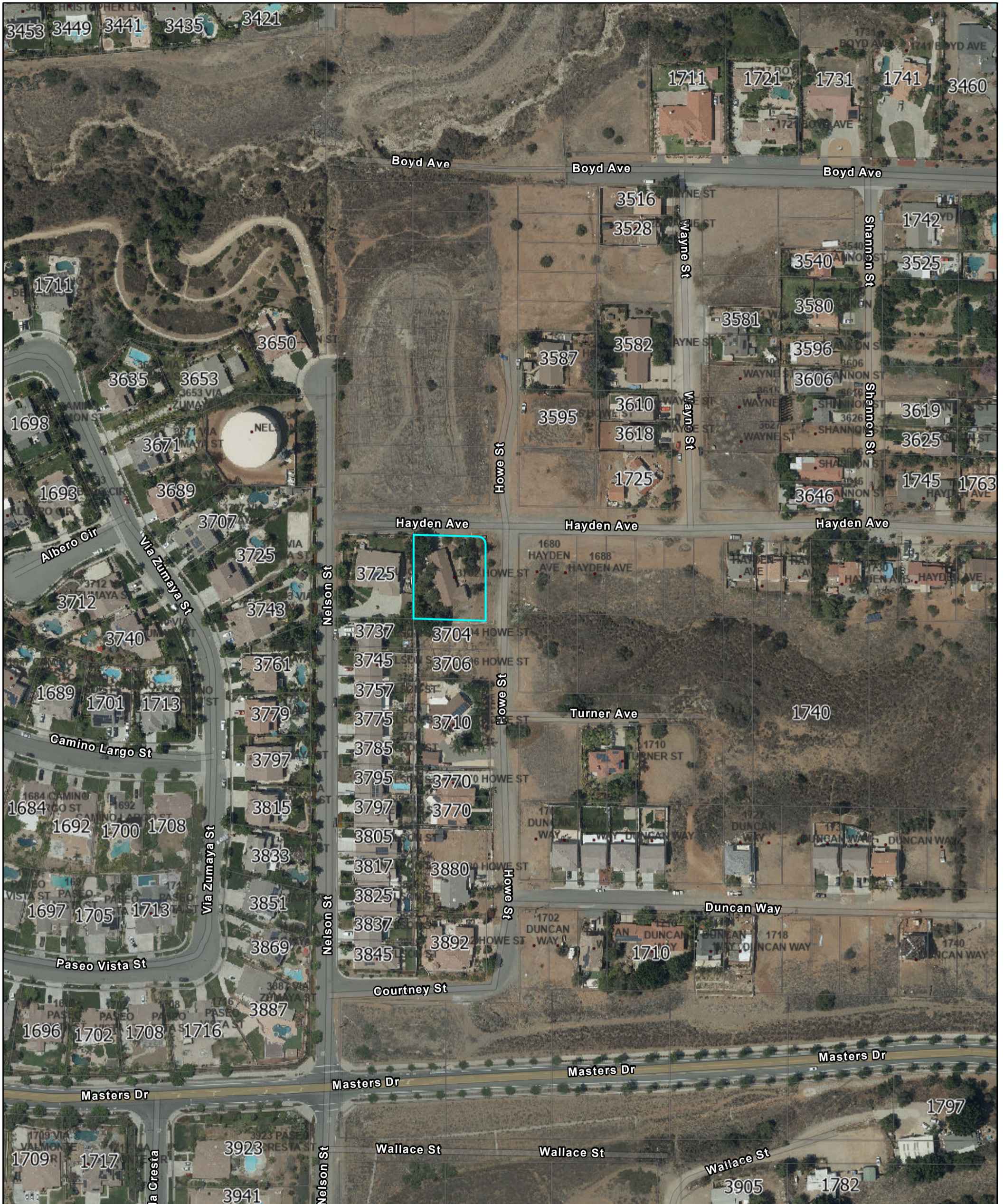
EXHIBIT 1 - SITE PLAN