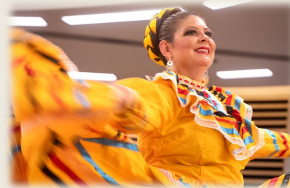
Hispanic Heritage Month