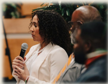
Black History Month