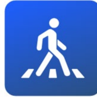
Safe Streets & Roads