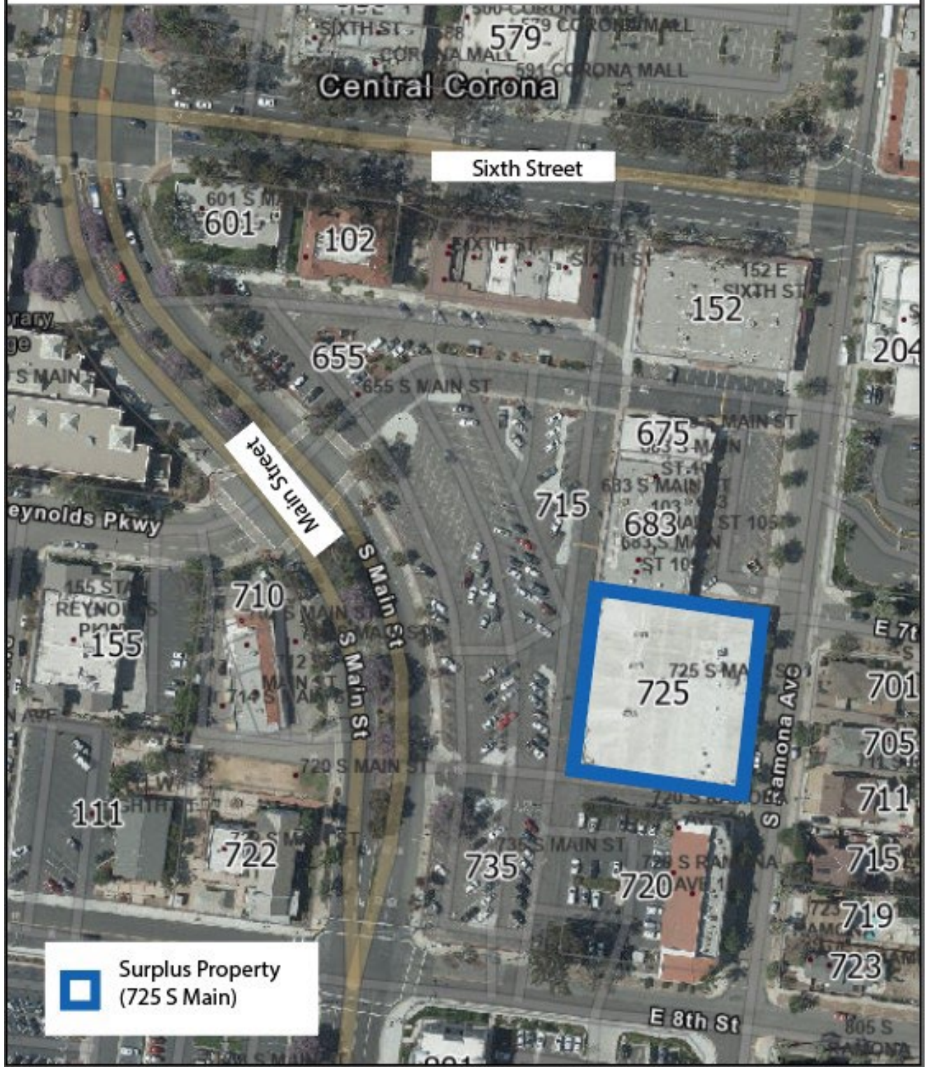
EXHIBIT 2 - SITE MAP