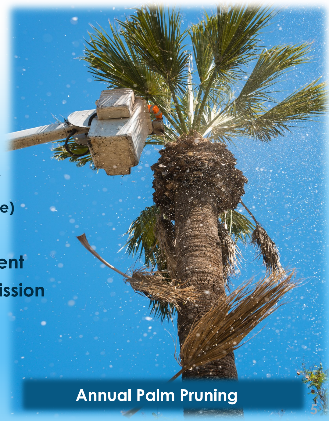
Annual Palm Pruning