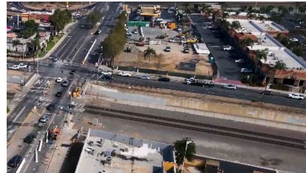
Sampson Ave - Westbound