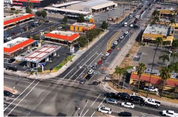
McKinley St – Northbound