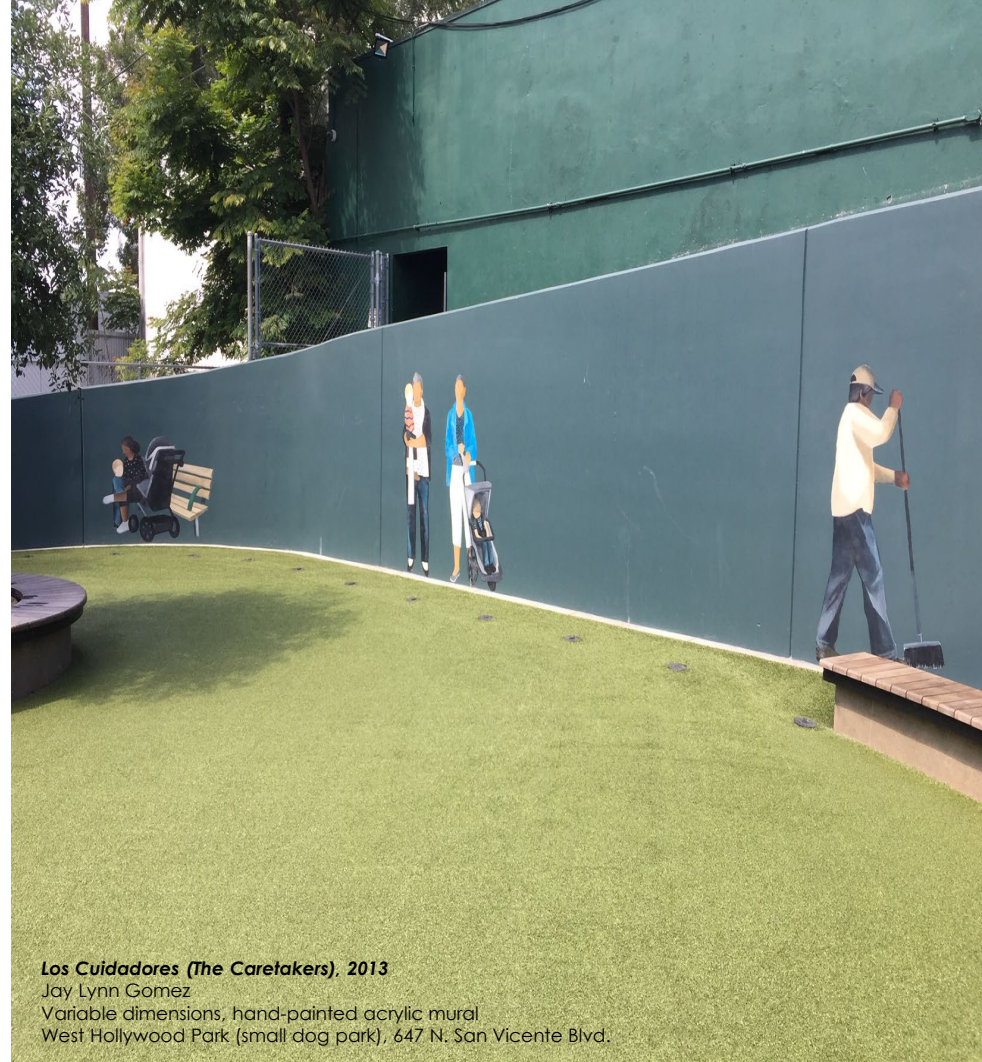
Los Cuidadores (The Caretakers), 2013