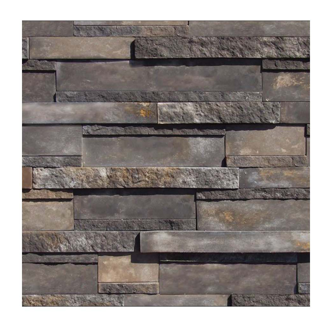
STONE VENEER CORONADO STONE ELEMENT LEDGESTONE MOUNT VERNON