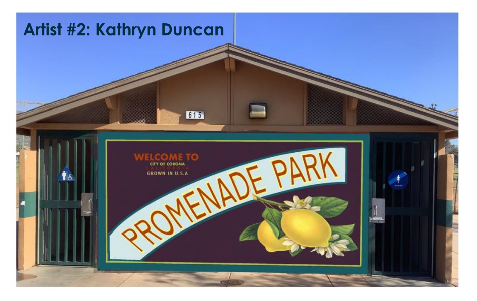
Front side facing street and parking lot