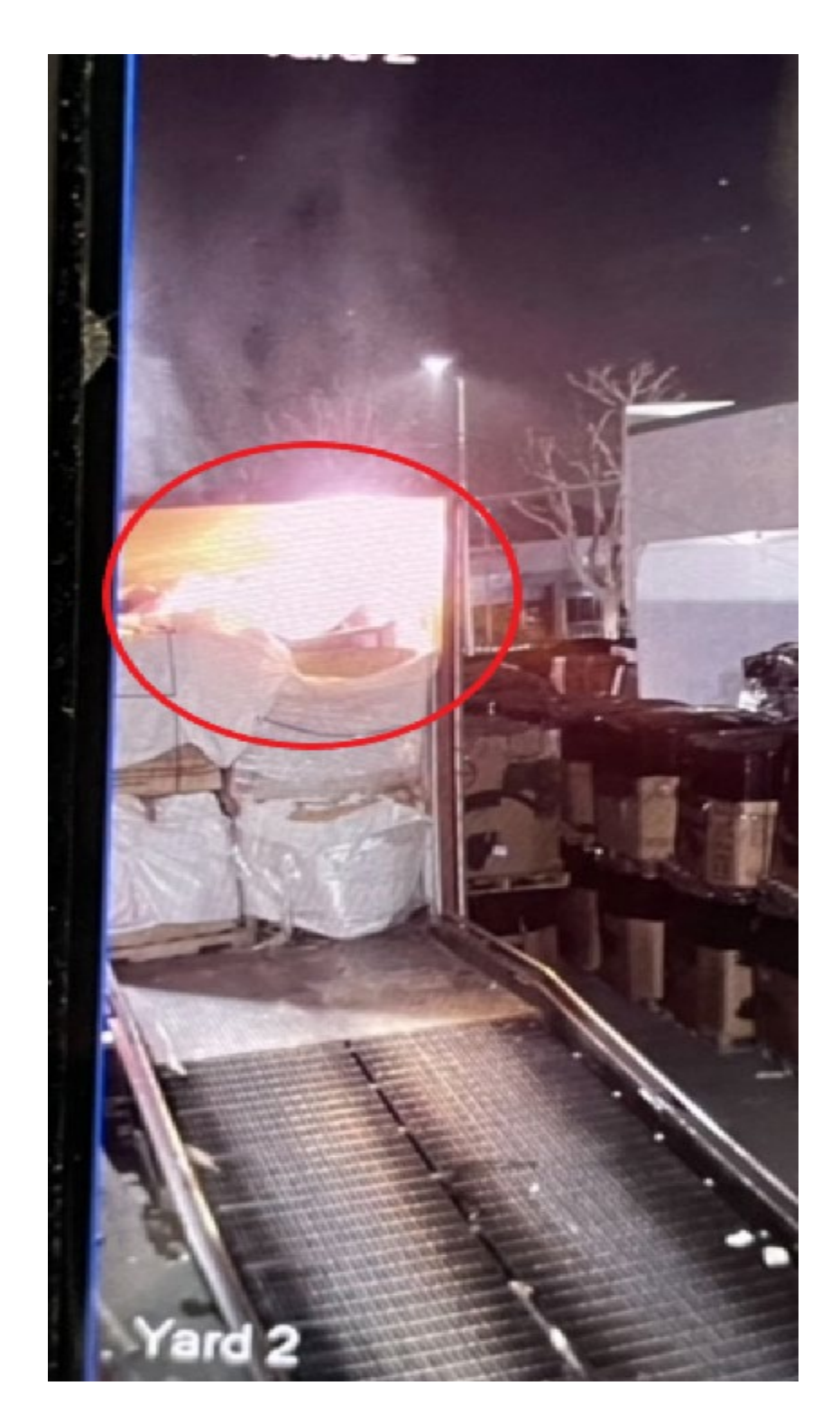
Video surveillance footage shows the start of the fire in the shipping container