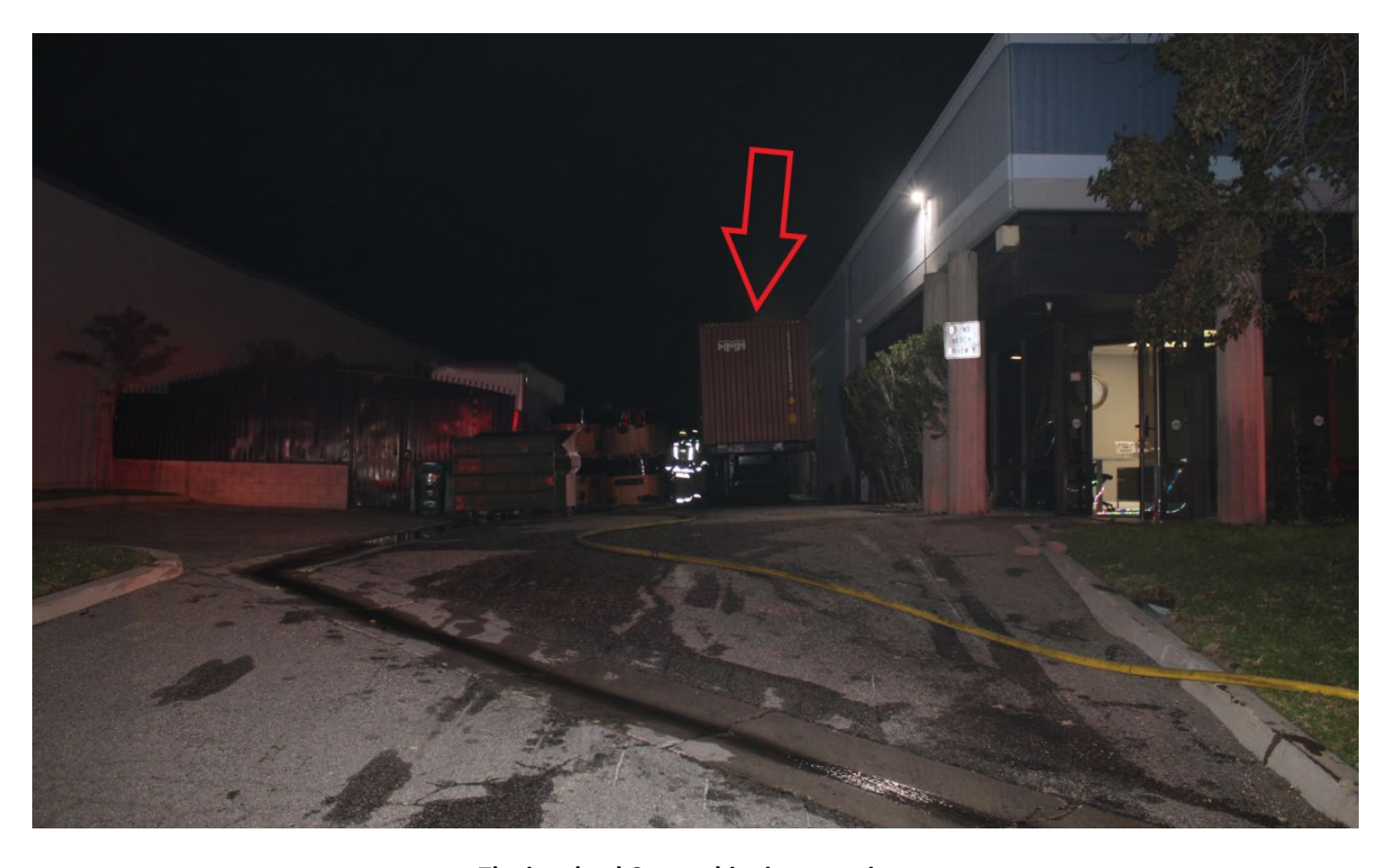
The involved Conex shipping container