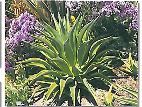
Agave desmettiana 'Variegata'