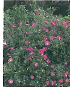
Cistus x purpureus