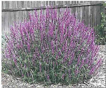
Salvia leucantha 'Santa Barbara'