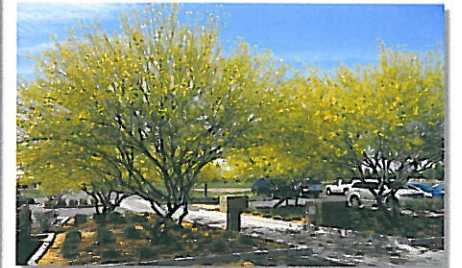
Cercidium x 'Desert Museum'