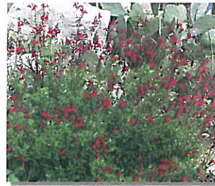
Salvia g. 'Furman's Red'