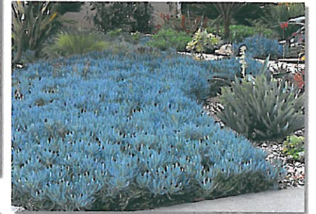
Senecio 'Blue Chalk Sticks'