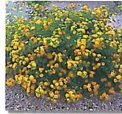
Lantana x 'New Gold'