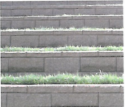
TERRACE SEAT WALL CONCEPT W/ SEGMENTAL BLOCK