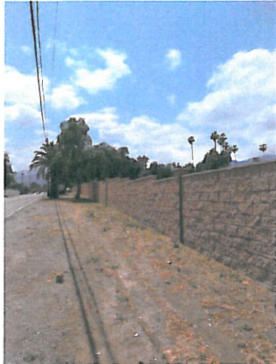
EXISTING 6' HT. CMU WALL W/PILASTERS AT STATE ST.