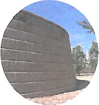
SEGMENTAL BLOCK RETAINING WALL