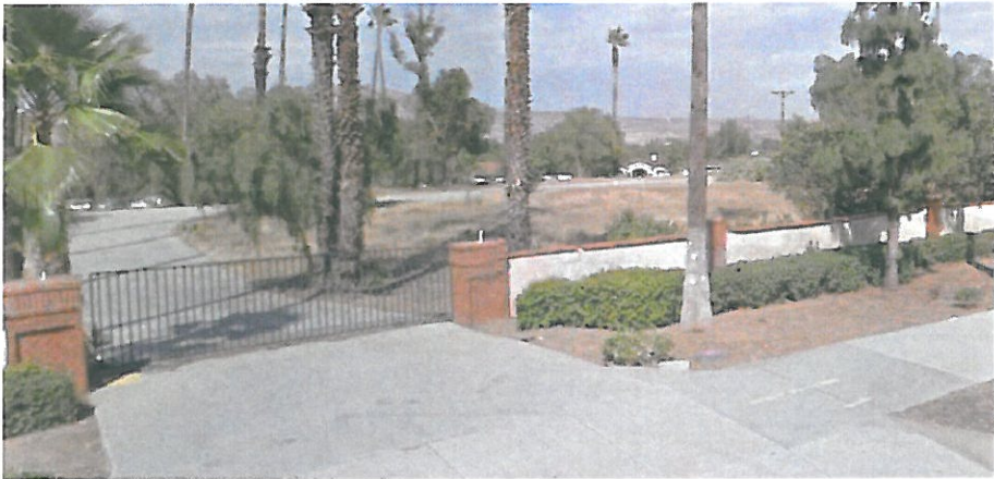
EXISTING FRONTAGE WALL AT FOOTHILL PKWY.

RETAINING WALL NOTE ANY RETAINING WALL OVER 3' IN HEIGHT SHALL HAVE A MIN. 42" HT. GUARD RAIL AT TOP. TENNIS COURT ENCLOSURES AT TOP OF A RETAINING WALL IS ACCEPTABLE IN PLACE OF A GUARD RAIL. TYP. DECORATIVE WALL NOTE ALL NEW PERIMETER AND RETAINING BLOCK WALLS SHALL BE CONSTRUCTED OF DECORATIVE MASONRY (SLUMPSTONE, SPLIT FACE BLOCK OR OTHER SIMILAR MATERIAL). MATERIALS SHALL BE APPROVED BY THE DEVELOPMENT DEPARTMENT.