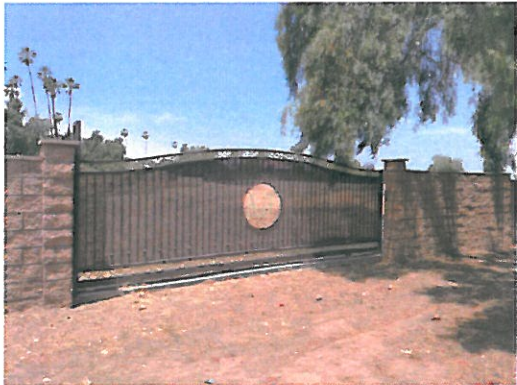
EXISTING GATE AT STATE ST.