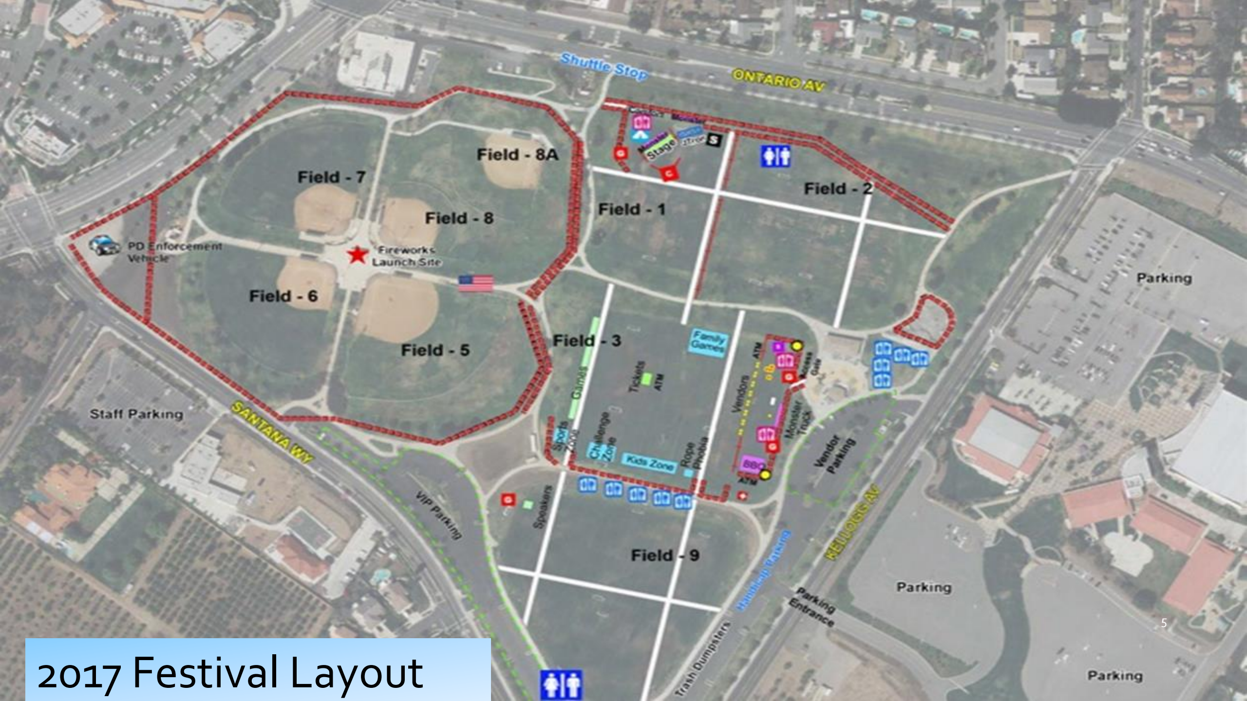
2017 Festival Layout