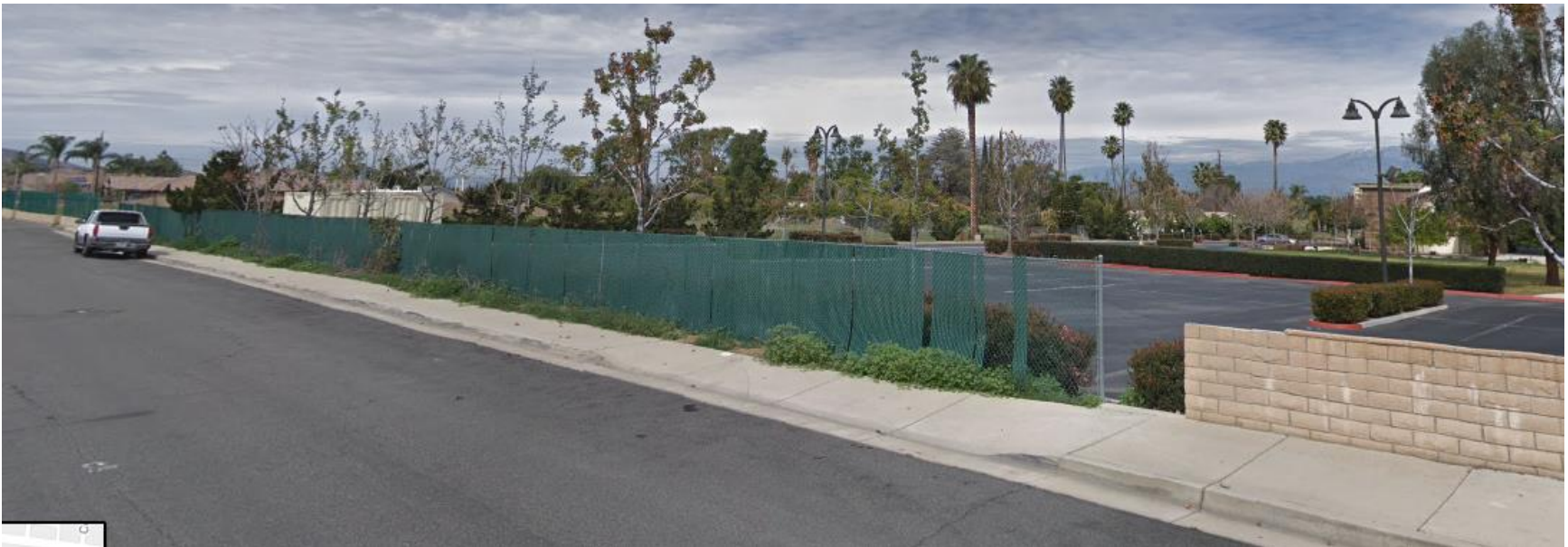
View of existing chain link fence from Othello Lane looking south