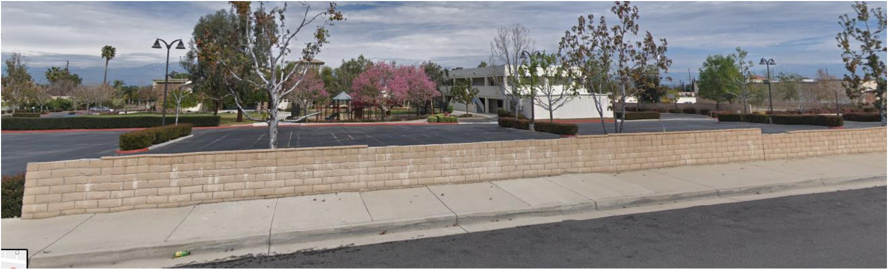
View of existing block wall from Othello Lane looking south