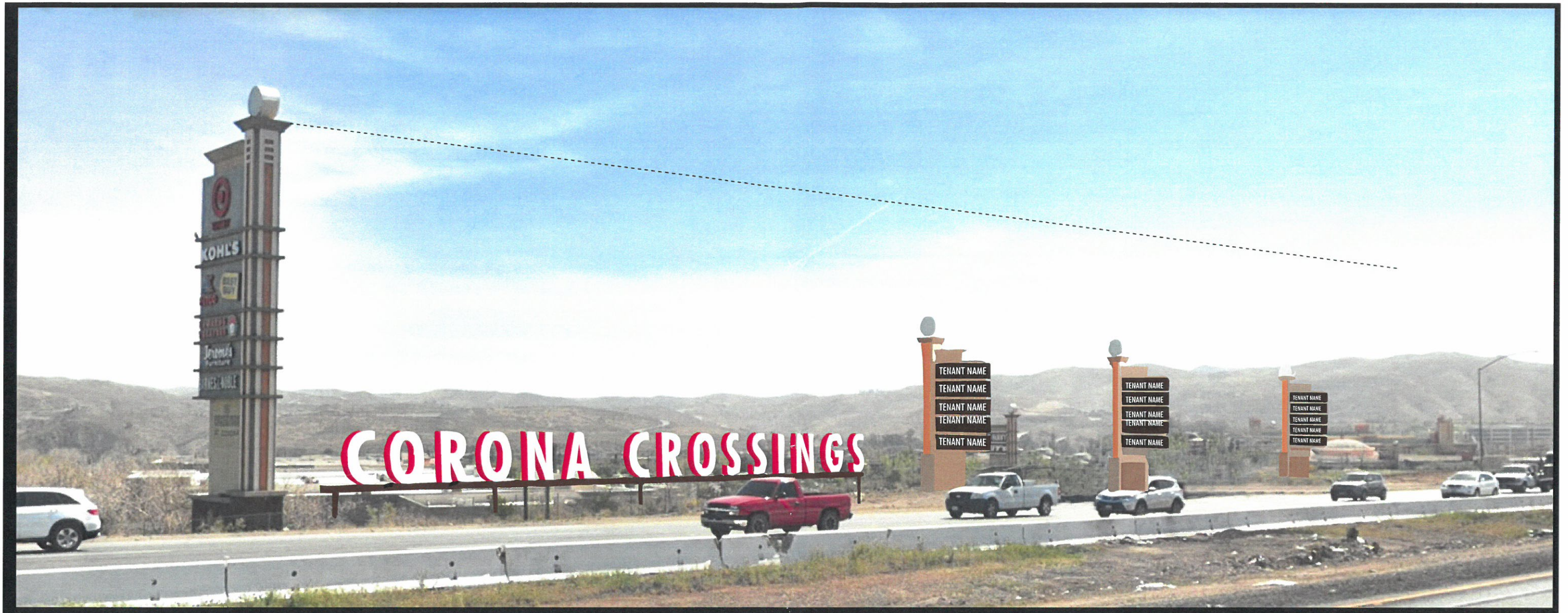
VIEW OF PROJECT FREEWAY SIGNS FROM THE I-15 TRAVELING SOUTH