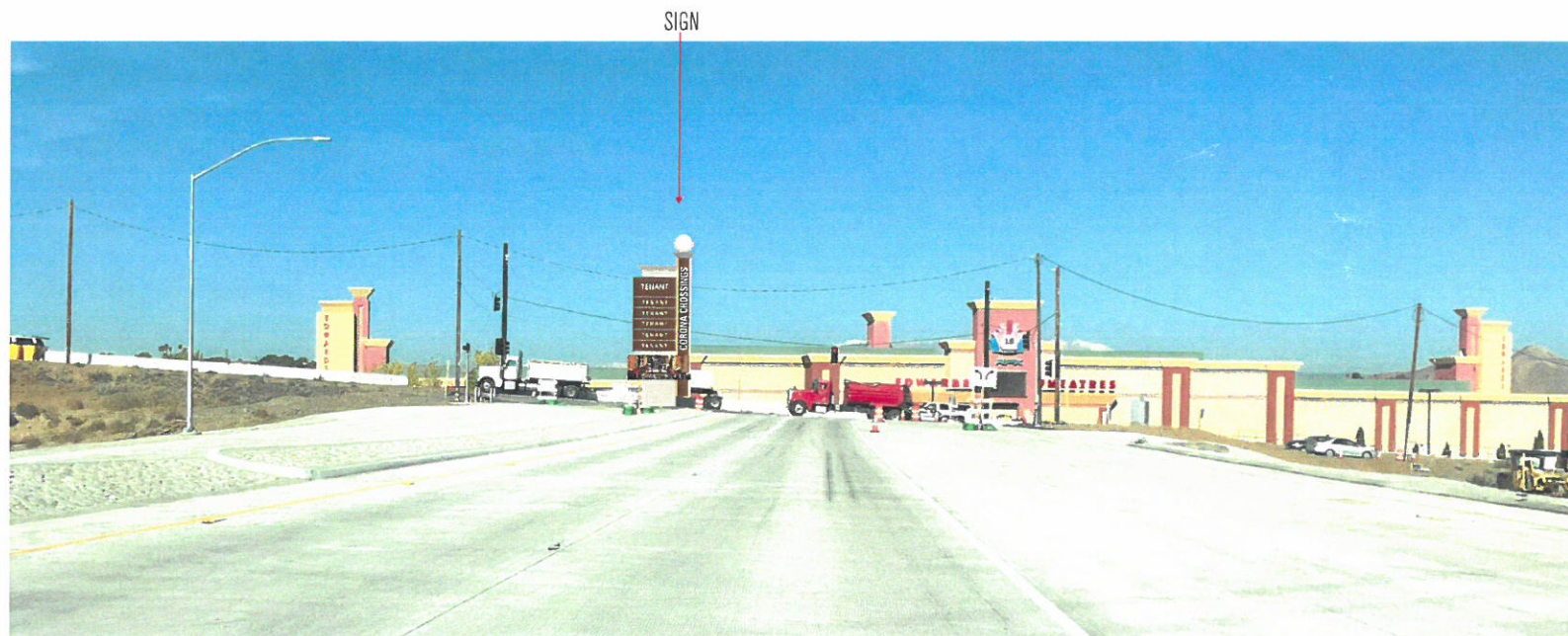
VIEW OF PROJECT FROM THE I-15 TRAVELING NORTH