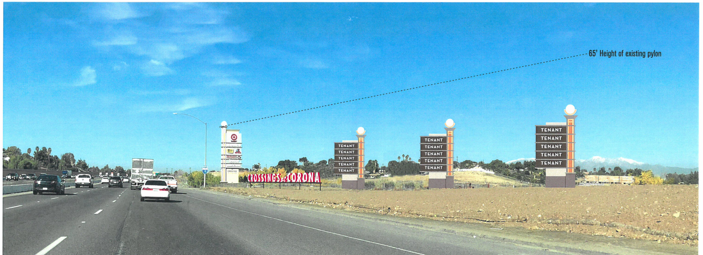
VIEW OF PROJECT FREEWAY SIGNS FROM THE I-15 TRAVELING NORTH