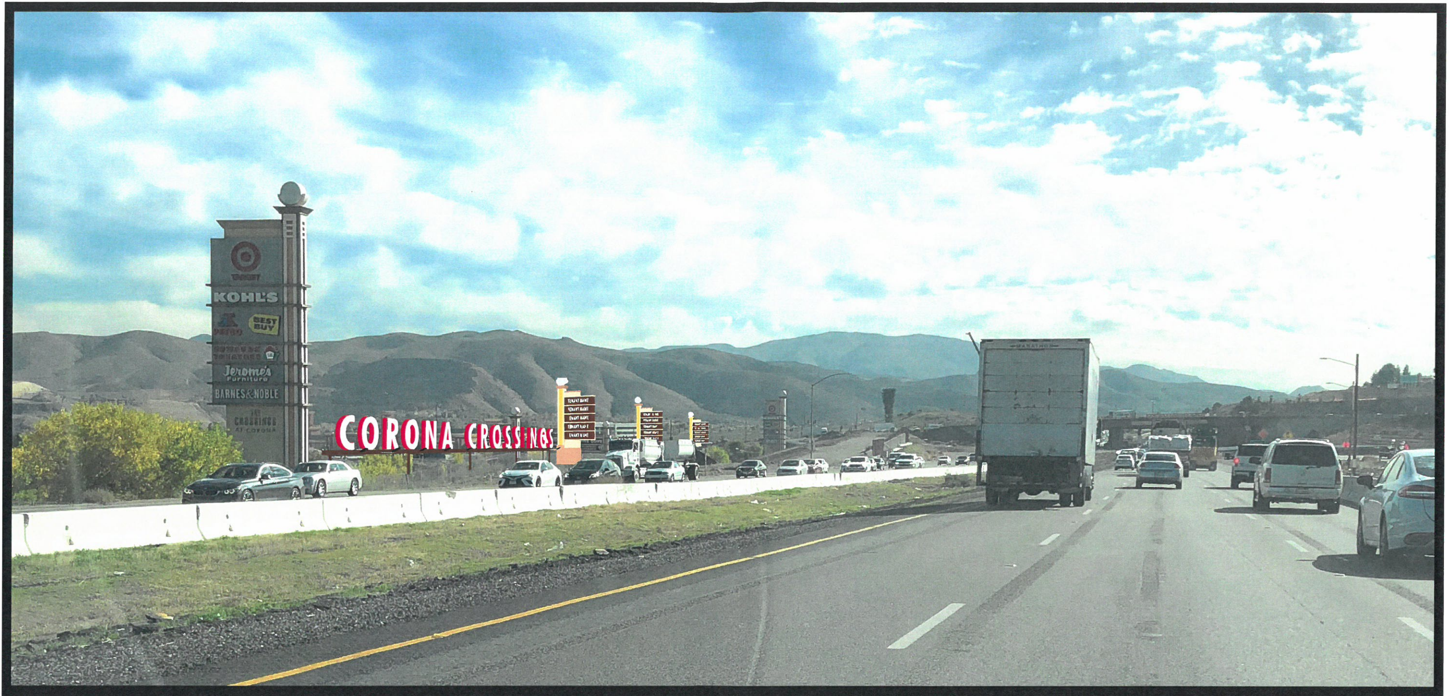
VIEW OF PROJECT FREEWAY SIGNS FROM THE I-15 TRAVELING SOUTH