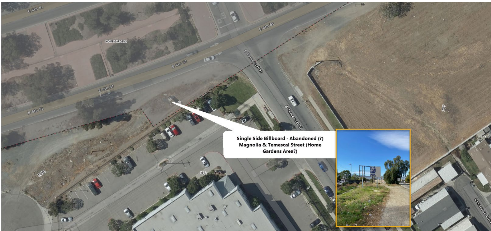
Single Side Billboard - Abandoned (?) Magnolia & Temescal Street (Home Gardens Area?)

Surface Street Billboard F3 Magnolia Ave & Temescal Street Unincorporated County in City SOI