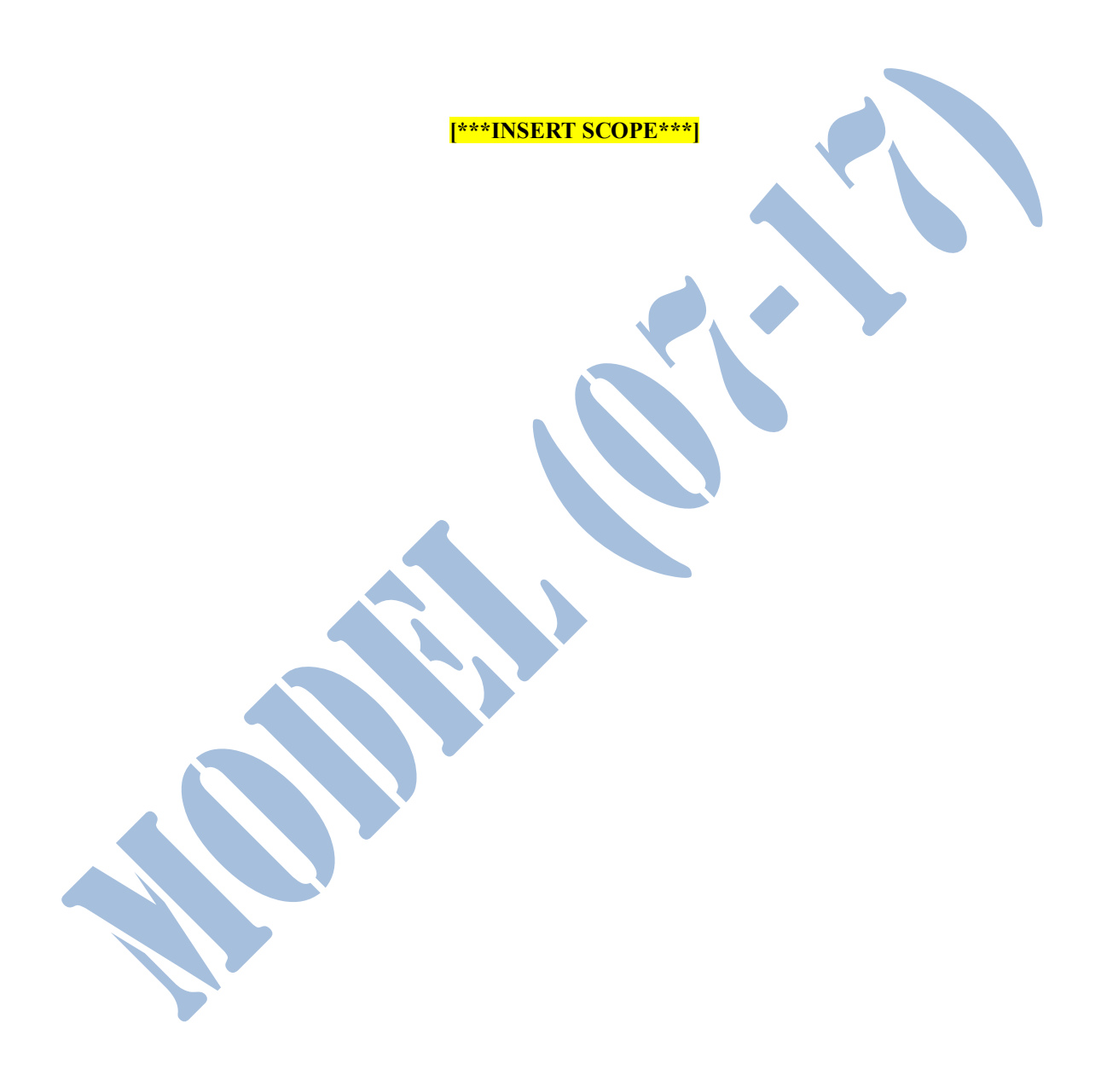
EXHIBIT "A" SCOPE OF SERVICES