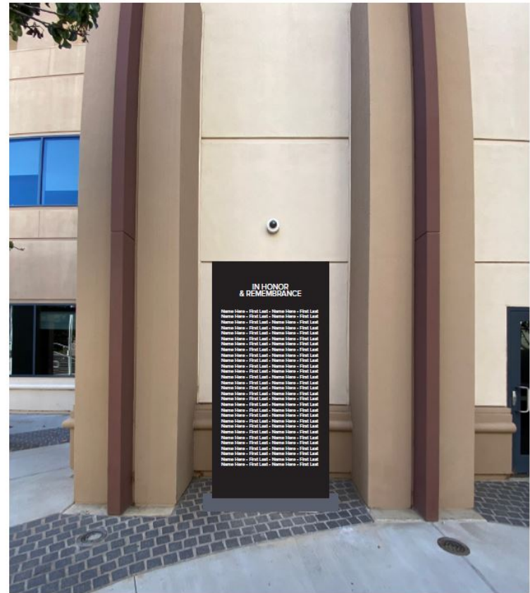
One Granite Wall on each side of the Veterans Cove Sign